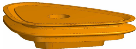
COMPUTER AIDED DESIGN